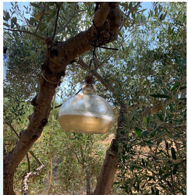
Figure 2. Pictures from the field visit at olive orchards located in the Messara valley, Crete